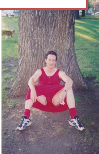
MB pre-baby body.