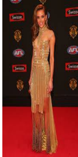
Bec Judd post-baby body.